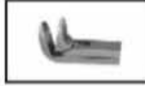
S.023 90° UP