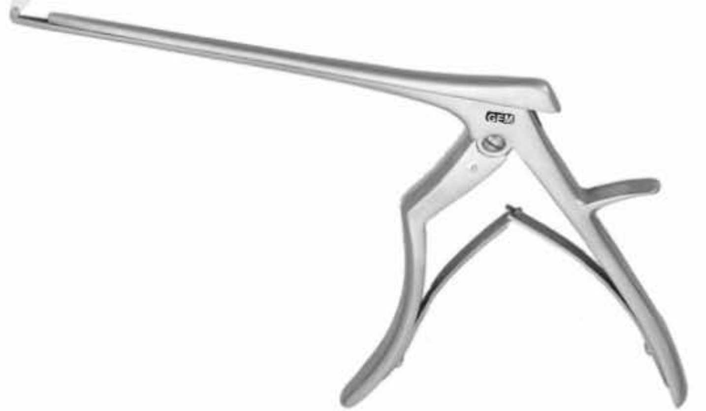
Antrum Punch Through Cutting 13cm