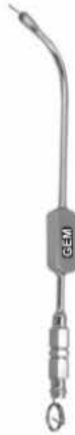
VELCKEN Antrum Cannula, 15 cm, S.007