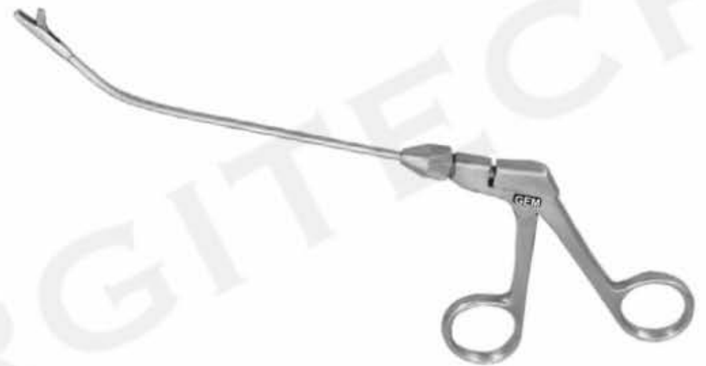
Through Cutting Punch Forceps Upward (Rotatable)