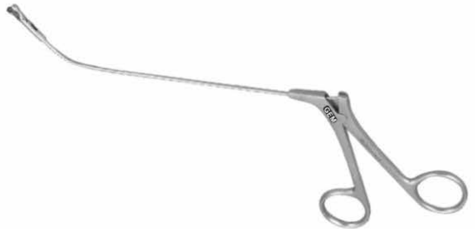
Frontal Sinus Punch Forceps (Giraff) 55° Double Action