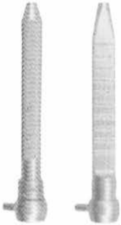
S.004 Sinuscopy Handle Round/Flat 11cm lenthgth