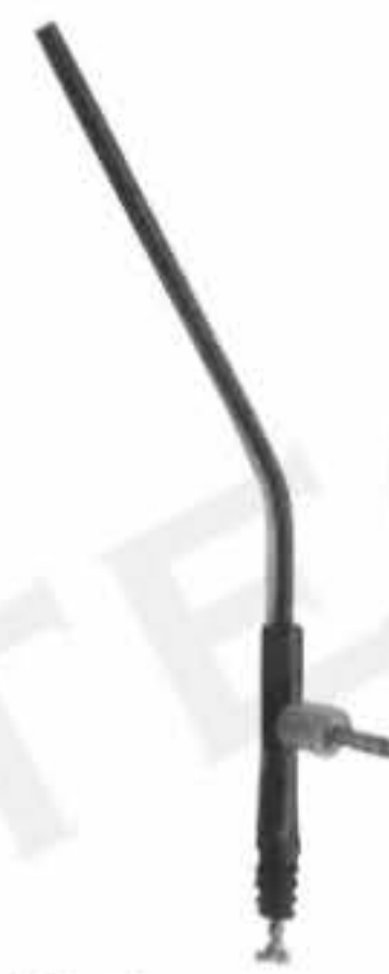
Bipolar Suction Tube, ball ended S.010