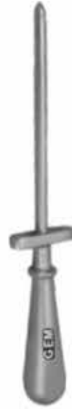
Trocar and Cannula Sinuscopy, S.005 Billshaped beak S.006 Oblique beak