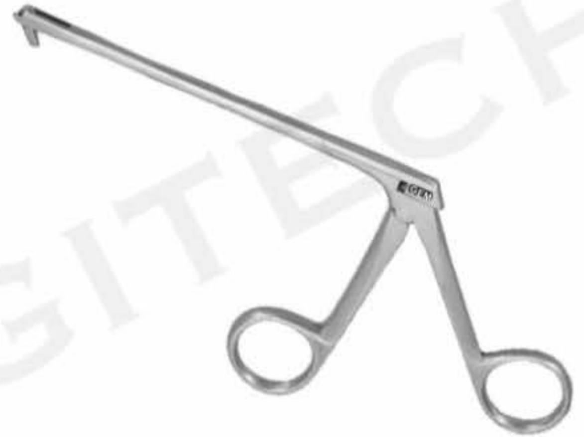
Antrum Punch Backward Cutting Forceps