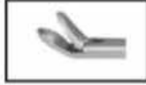
S.022 45° UP