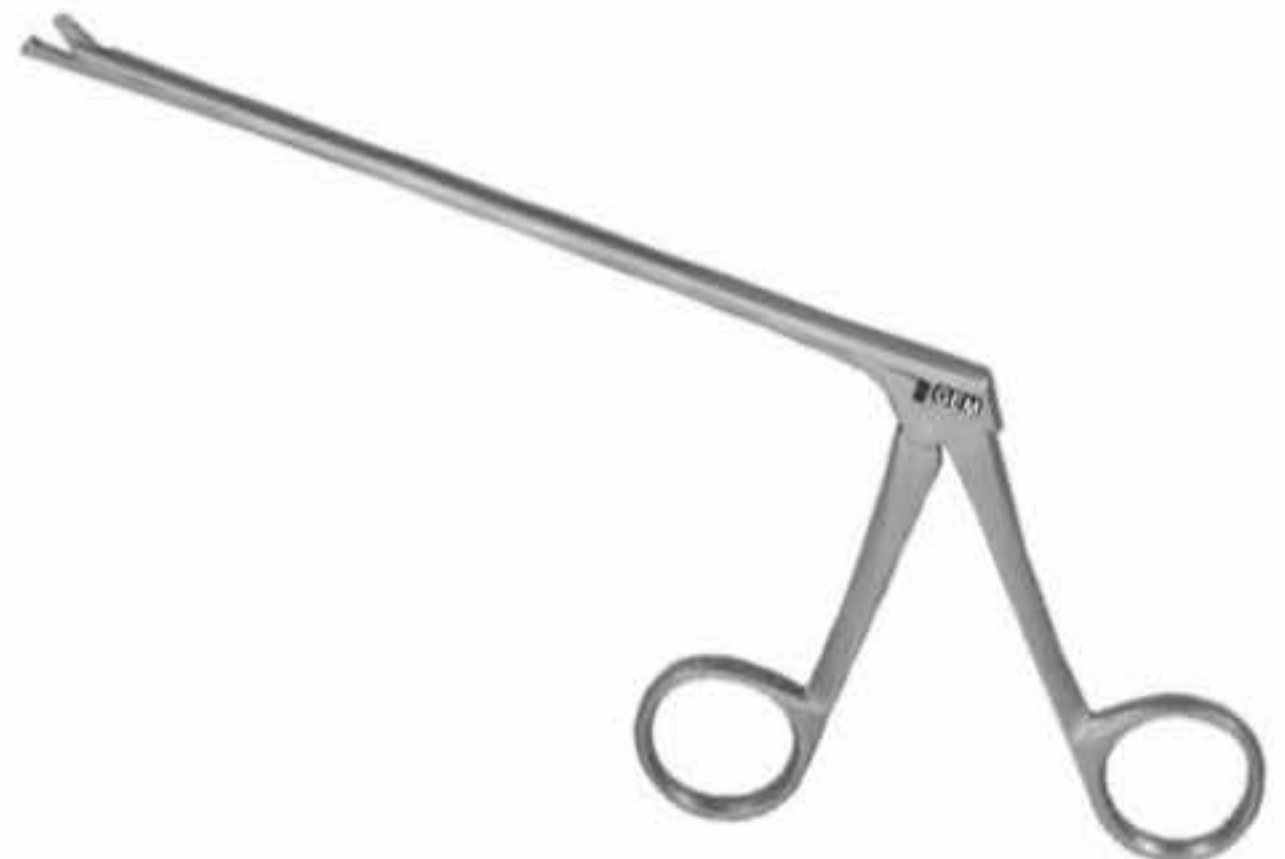
Through Cutting Punch Forceps