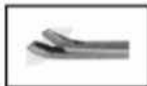
S.030 45° UP