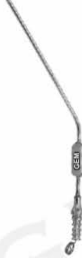
FRAZIER Suction Tube, ball ended S.009